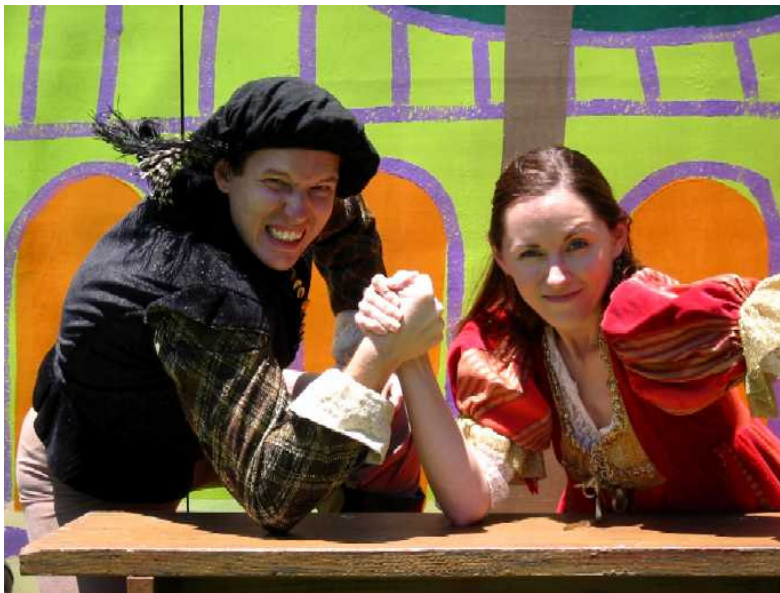
Culver City Public Theatre Presentation of Shakespeare's Skum: the Shrew Variations , 2005 Summer Season